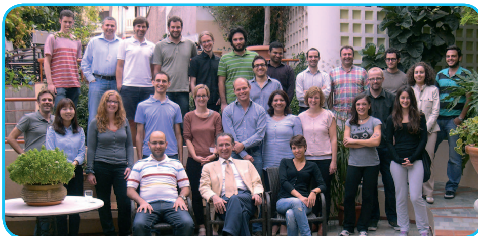
FIG 4 Short Course participants, Chania, Greece, October 8-12, 2012.