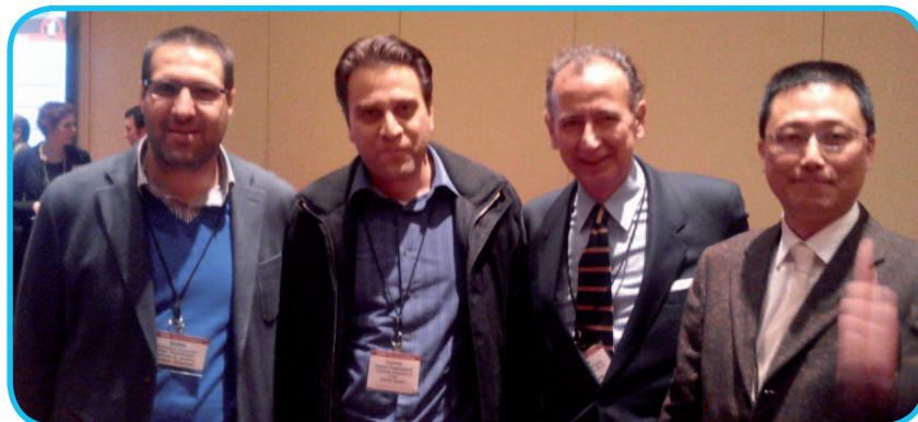
FIG 1 Current and former members of DSSL at the 93rd TRB Meeting in Washington, DC, in January 2014.

Freeway Traffic Control - Development of control strategies for local (ALINEA) and coordinated (METALINE, HERO) ramp metering, variable speed limits, and mainstream traffic flow control on freeways. Development of an advanced nonlinear optimal control tool for integrated freeway traffic control (AMOC). ALINEA was field-tested or is operational in Paris (FR), Amsterdam (NL), Glasgow and England motorways (UK), Bavarian freeways (DE), Tel Aviv (IL), Victoria and Queensland (AT) and has meanwhile some 400 installations in several countries in Europe, Israel, Australia, U.S.A. HERO is an award-winning feed-